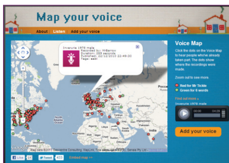
Figure 2. The Map Your Voice interactive map

1,500 recordings were contributed to Map Your Voice in five months, via mobile phones and web browsers, primarily from North America and Western Europe with smaller numbers from Africa, Asia, Australasia and Latin America. We rejected 25% of the recordings offered. The reasons for rejection included the absence of location information, poor audio quality, or deviation from the prescribed text. The results were added automatically to a public website where contributors and anyone with an interest can play the sounds directly from an interactive map interface 15 (Figure 2). Due to the large number of map points, we used Google fusion tables to create the map code rather than the standard Google map API that causes web page code bloat with many map points. The original audio files and metadata are being added to the British Library's collections and will be accessible permanently via a map interface on the Library's website at www.bl.uk/sound